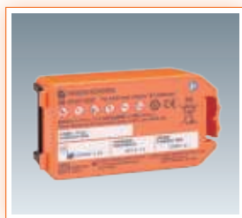
• Battery Pack (SB-310V)