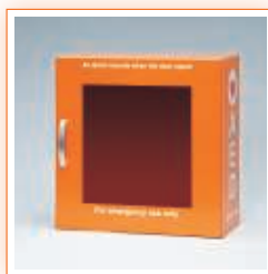
• AED Box (YZ-042H8)