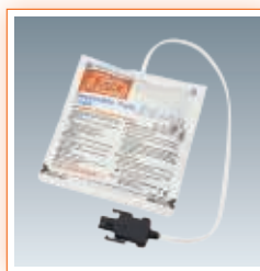
• Defibrillation Pads (P-740K)

This brochure may be revised or replaced by Nihon Kohden at any time without notice.